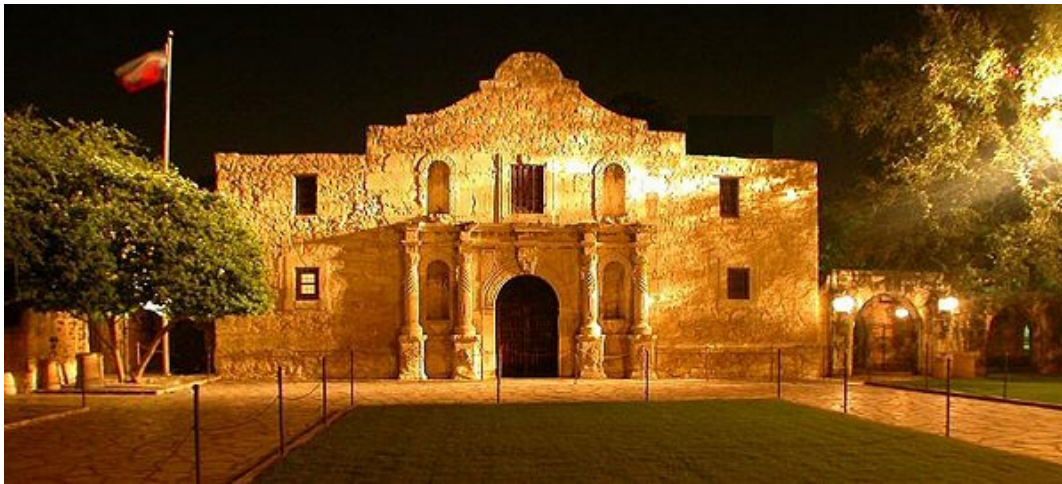
San Antonio, October 2004